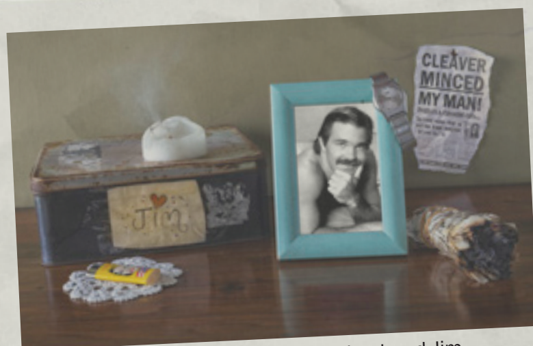
Brenda Bland's shrine to murdered husband Jim.

Connie is Harley Colee's trusted spy and personal assistant. A ruthless and savage teacher's pet. Annoying as Hell.