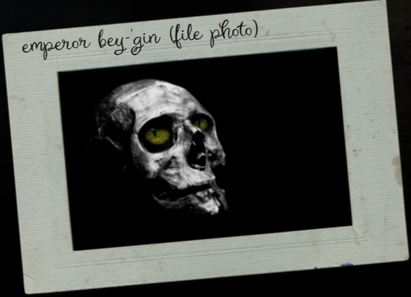
emperor bey-'gin (file photo)

Shirley's nemesis is revealed when she visits the doctor and he declares himself to be Emperor Bey-'Gin – an ancient ruler of their kind. They turn Shortall into a war zone as they fight dirty – that's when the shit really hits the fan.